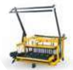
THE VISE Electric egg-laying machine: 35 DROPS / HOUR