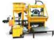
THE V3SE Hydraulic Paving machine 100 DROPS PER HOUR